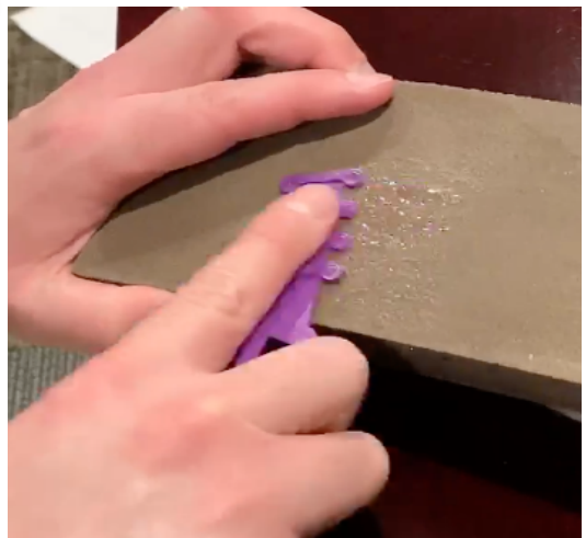
Figure 4. Dry sanding