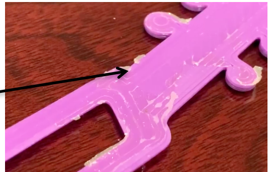
Figure 2. Aesthetic imperfections