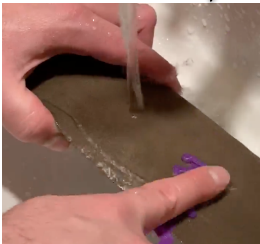
Figure 3. Wet sanding